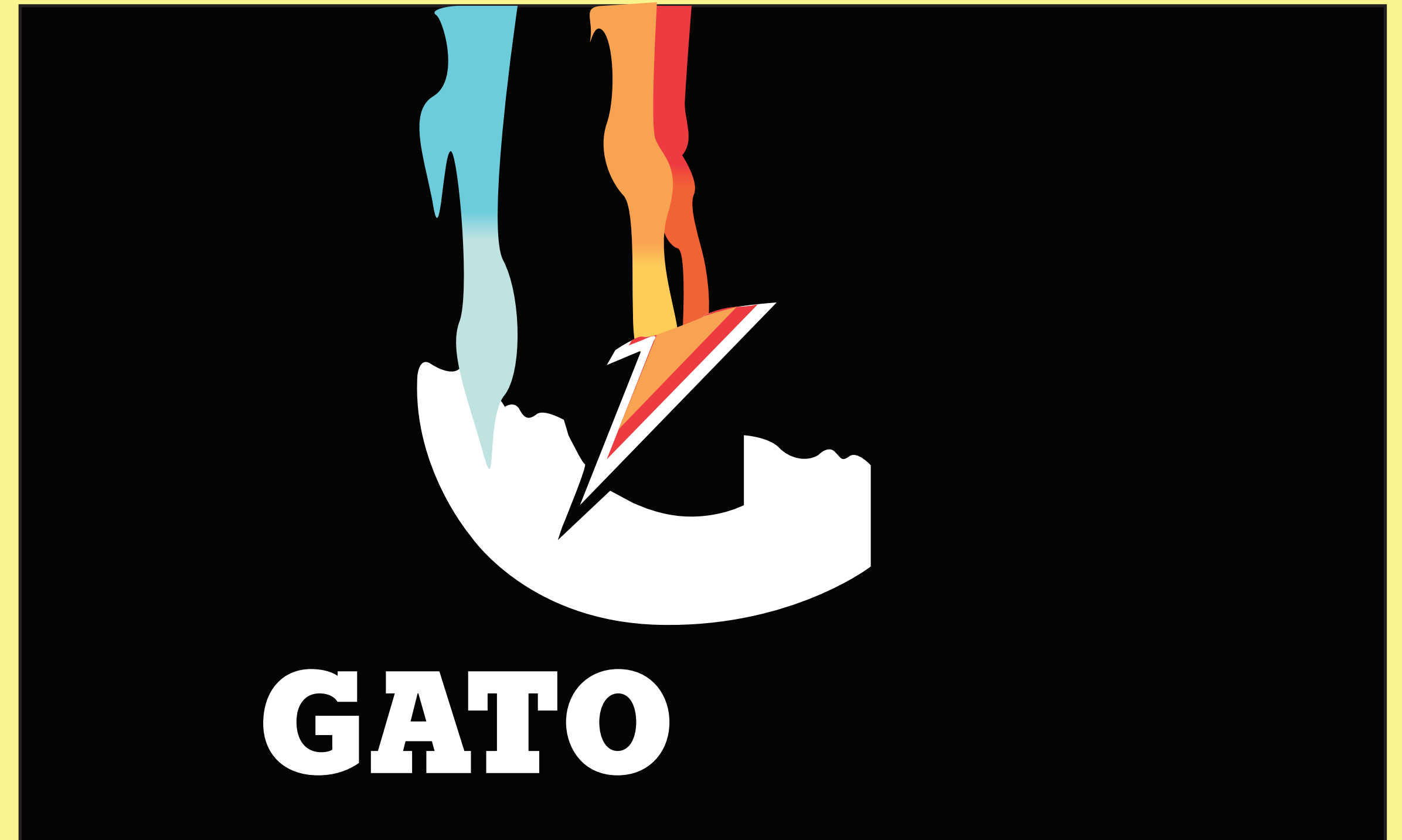
Panel 4: The color fluid will start to form the Gatorade logo as the type part of the logo starts to fade in.