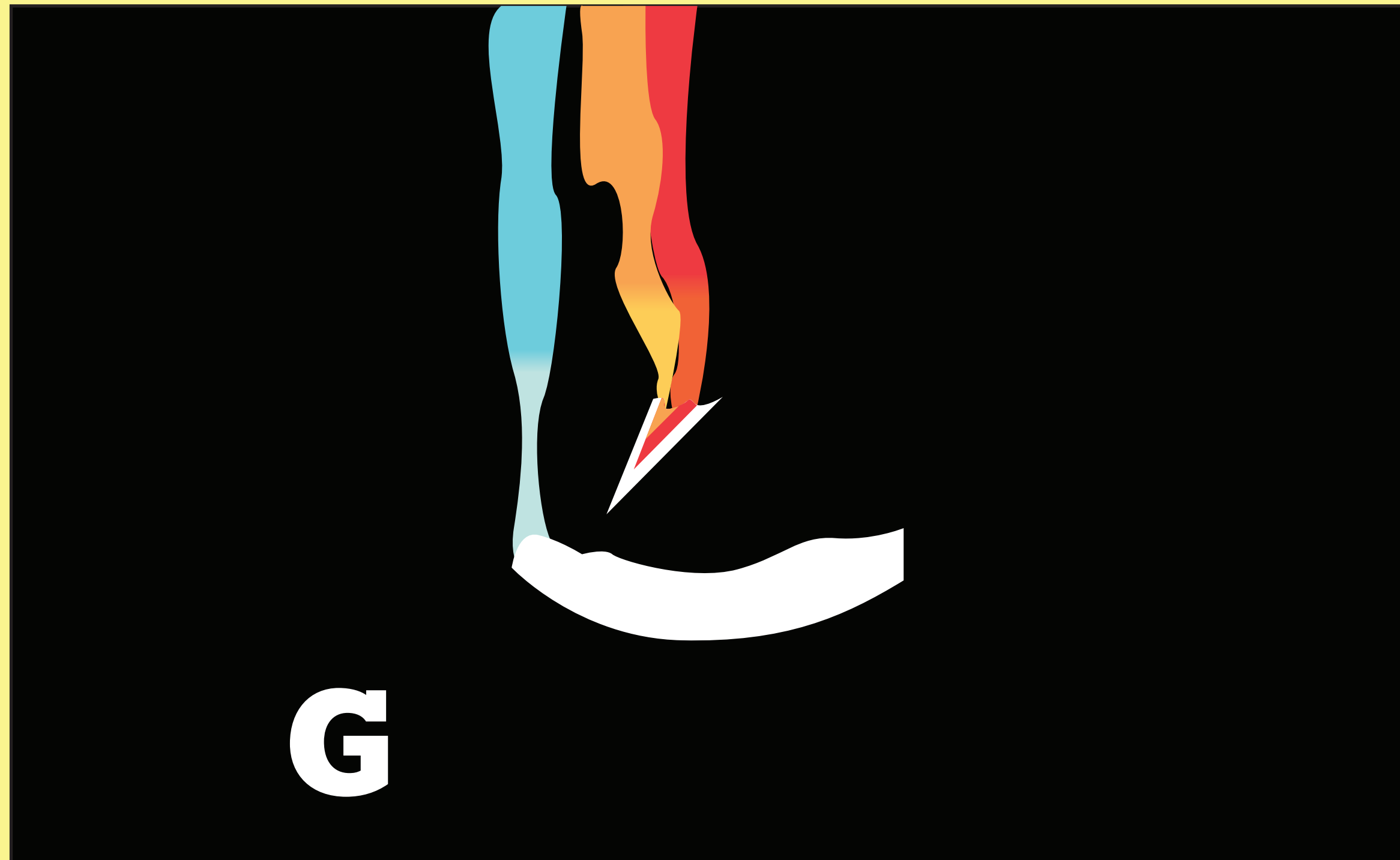
Panel 3: The color fluid will start to flow into a solid.