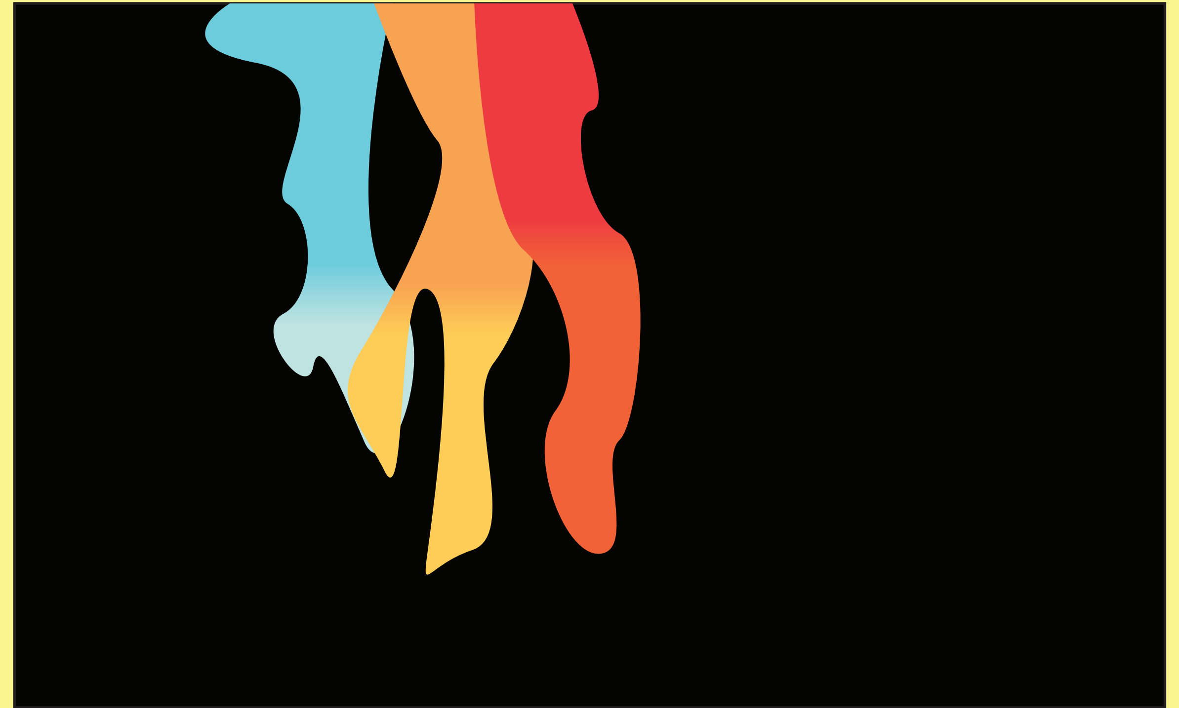
Panel 2: The color dripping will get longer like a waterfall.