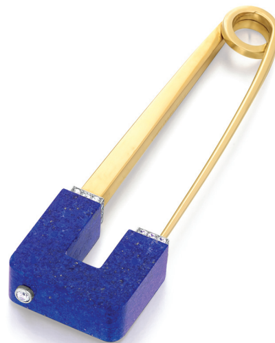
A French Diamond-Set Flower Brooch, c. 1960 by Cartier An Art Deco Platinum & Sapphire Dress Set, c. 1935 by Cartier A French Art Deco Diamond Jabot Brooch, c. 1915 by Cartier An English Art Deco Lapis Lazuli & Diamond Brooch, c. 1920 by Cartier