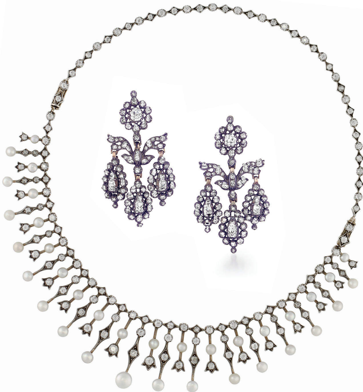
A Pearl & Diamond Necklace/Tiara in Original Box, c. 1880