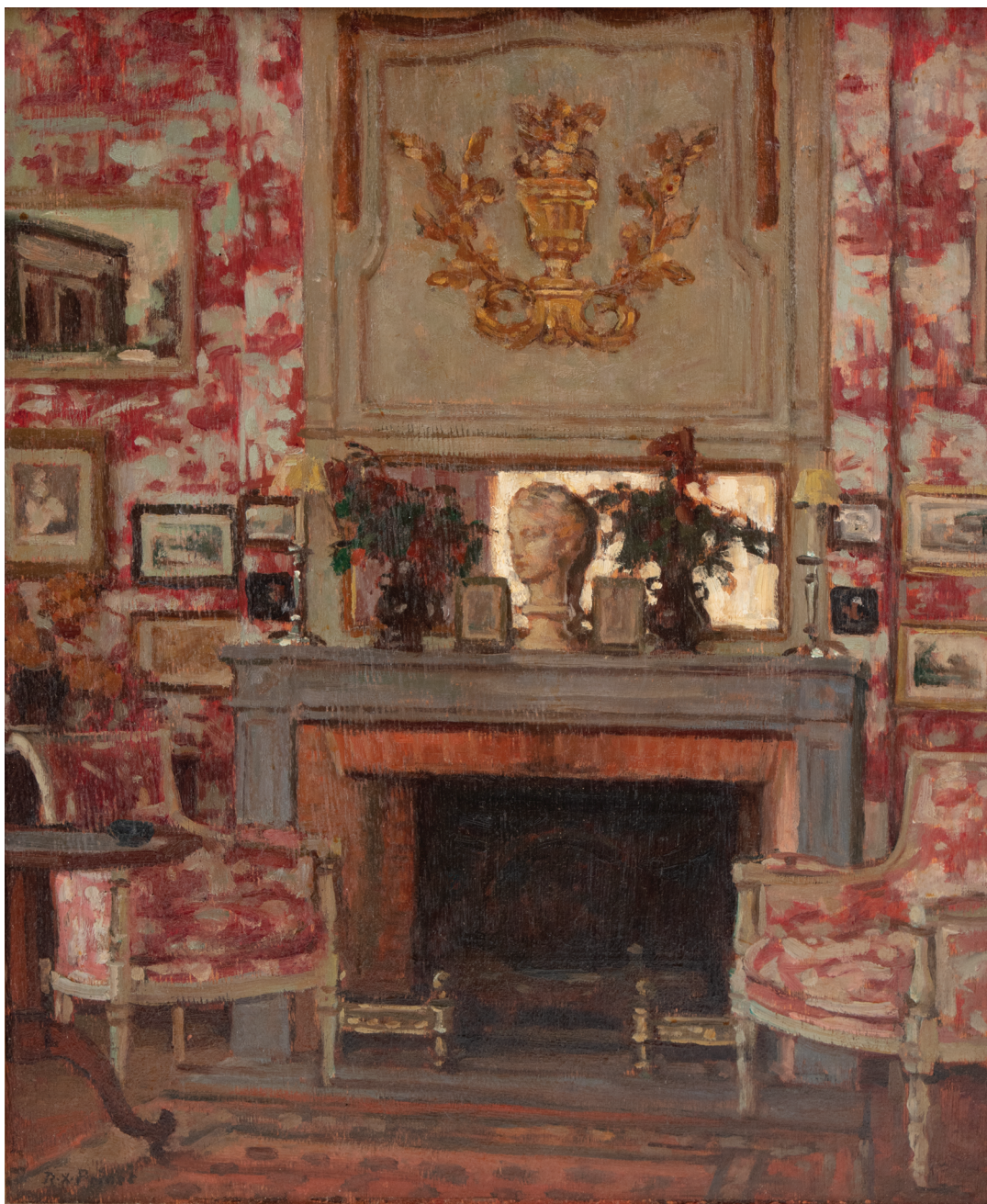
Interior Louis XVI