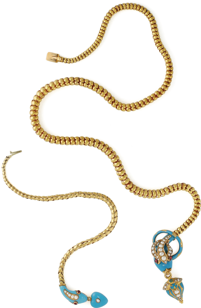
An Enamel & Pearl Snake Necklace & Bracelet, c. 1870