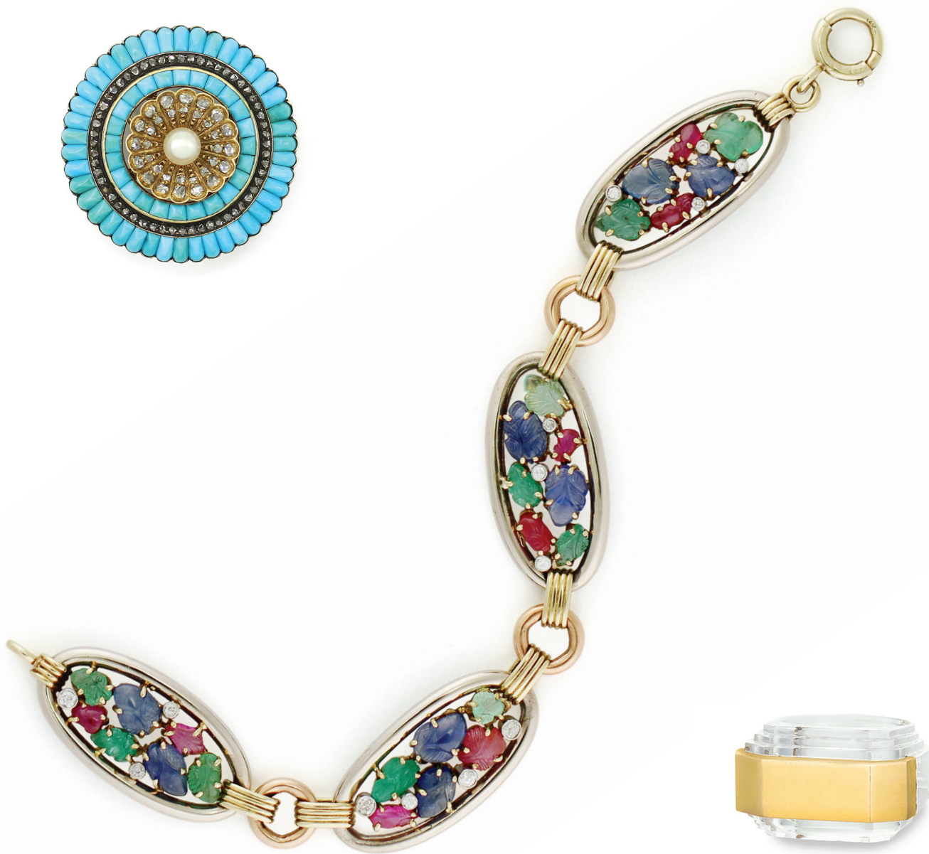
A French Turquoise, Pearl & Diamond Brooch, c. 1870