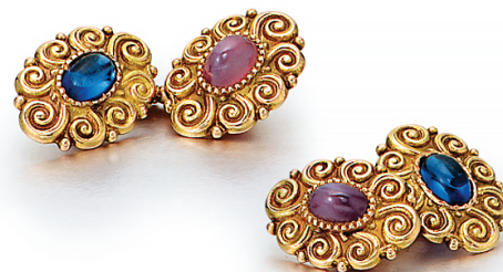
A Pair of Austrian Belle Epoque Gold & Colored Stone Cufflinks, c. 1900