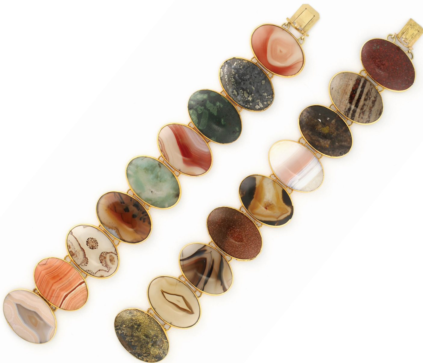
A Pair of Scottish Gold & Hardstone Bracelets, c. 1880