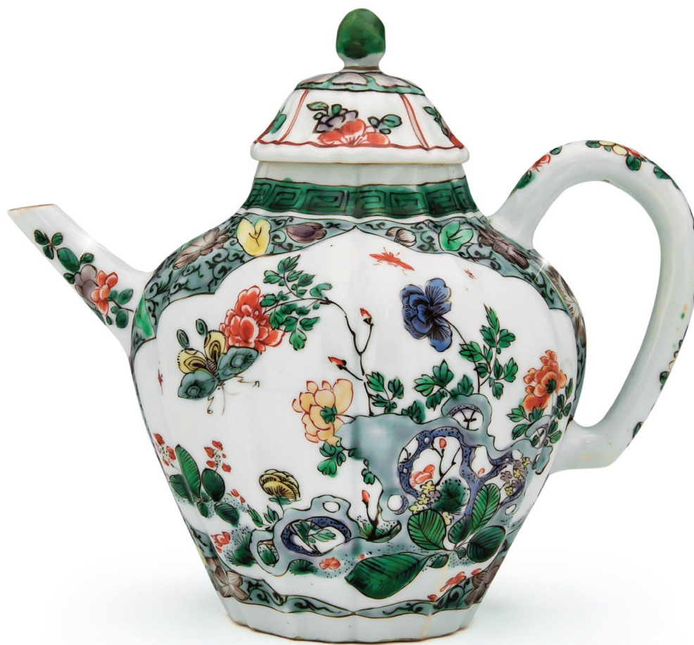
A Chinese Kangxi Famille Verte Porcelain Teapot, c. 1690